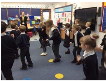
Year 3 & 4: