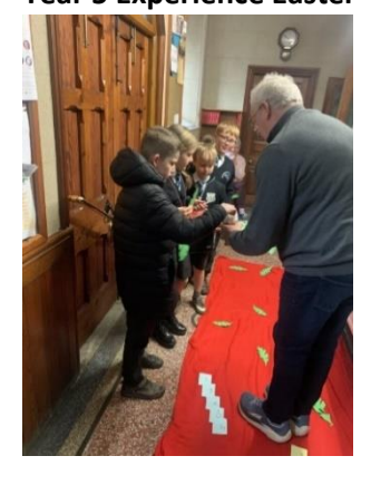
Year 5 Experience Easter

Thank you for joining us on our Easter Bonnet Parade and Church Service to celebrate Easter.